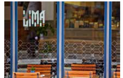
Lima, Rathbone Place