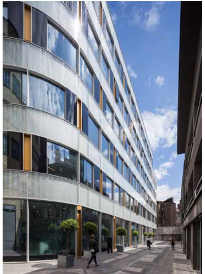
Charlotte Building, Evelyn Yard