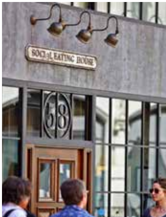
Social Eating House, Poland Street