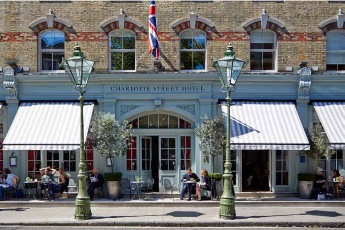
Charlotte Street Hotel, Charlotte Street