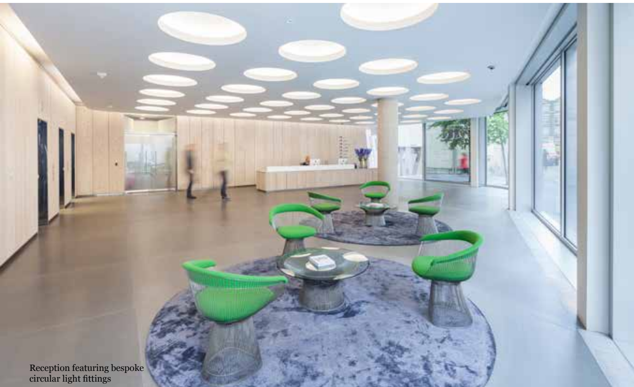
Reception featuring bespoke circular light fittings