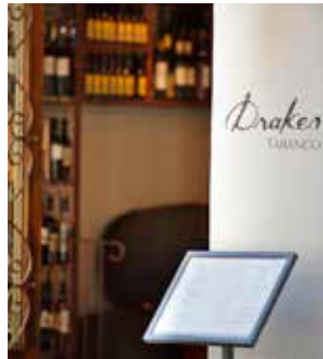
Drakes Tabanco, Windmill Street