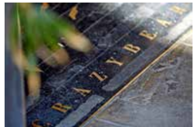
Crazy Bear Fitzrovia, Whitfield Street