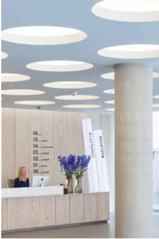
Reception featuring bespoke circular lighting