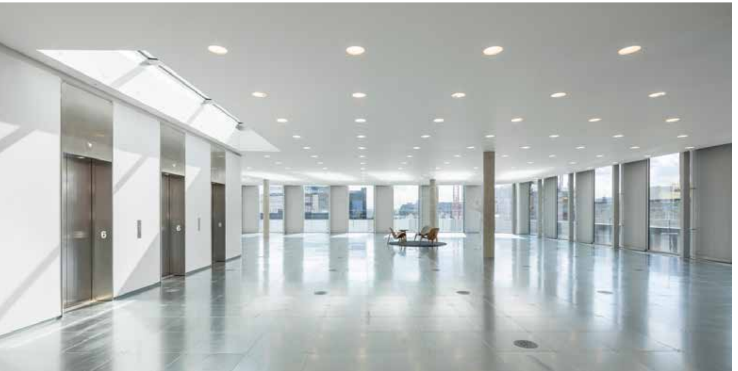
Sixth floor penthouse office