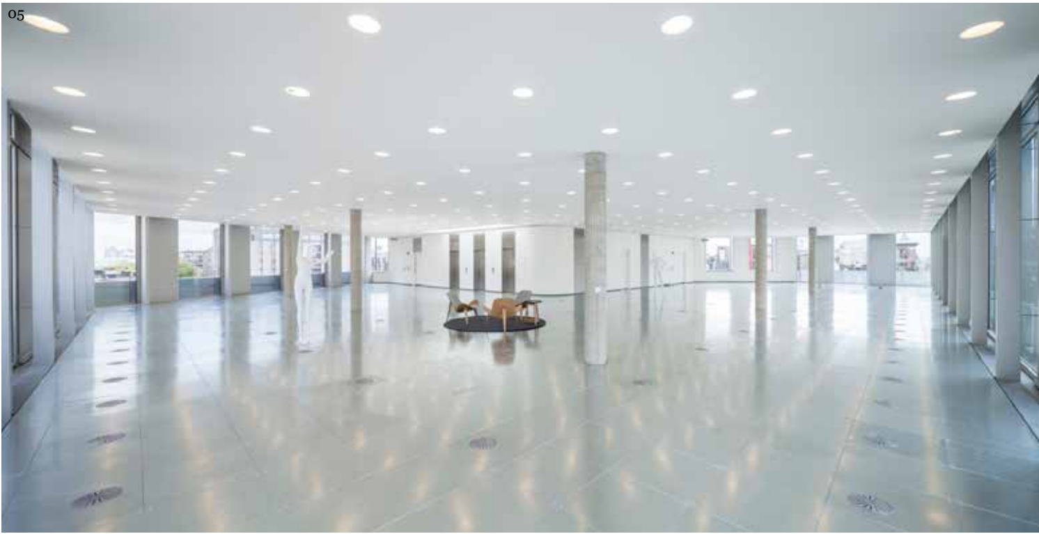
Sixth floor penthouse office