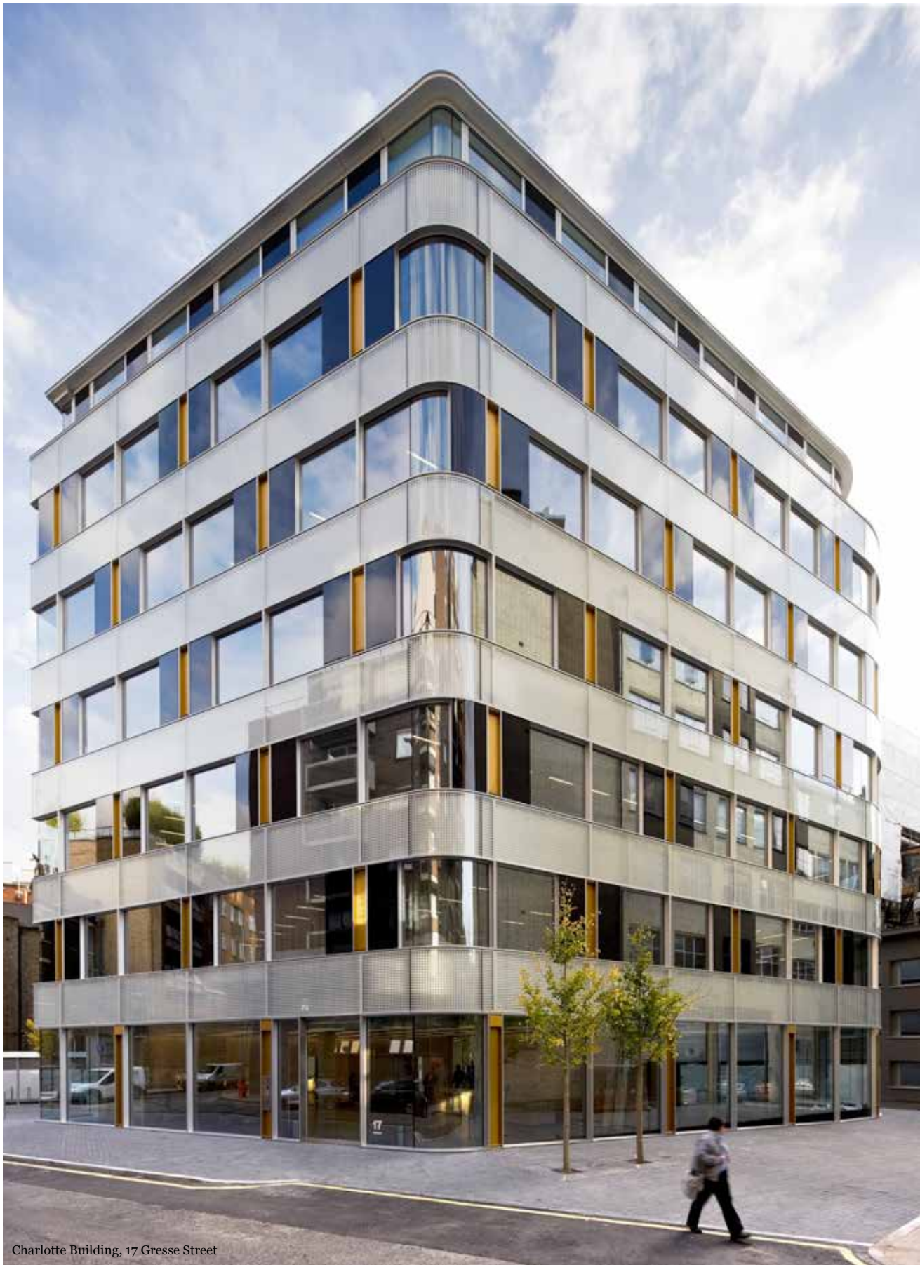
Charlotte Building, 17 Gresse Street