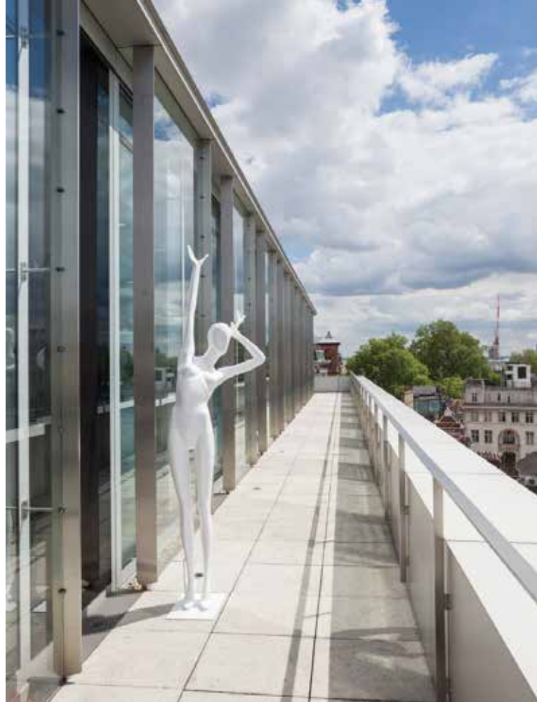
Sixth floor terrace