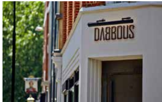
Dabbous, Whitfield Street