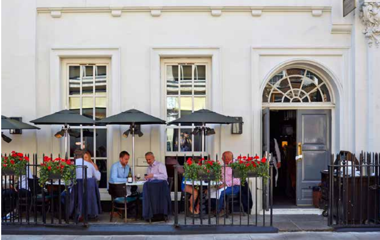
Dean Street Townhouse, Dean Street