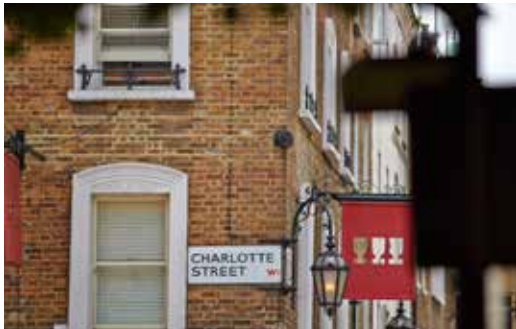
Charlotte Street, W1